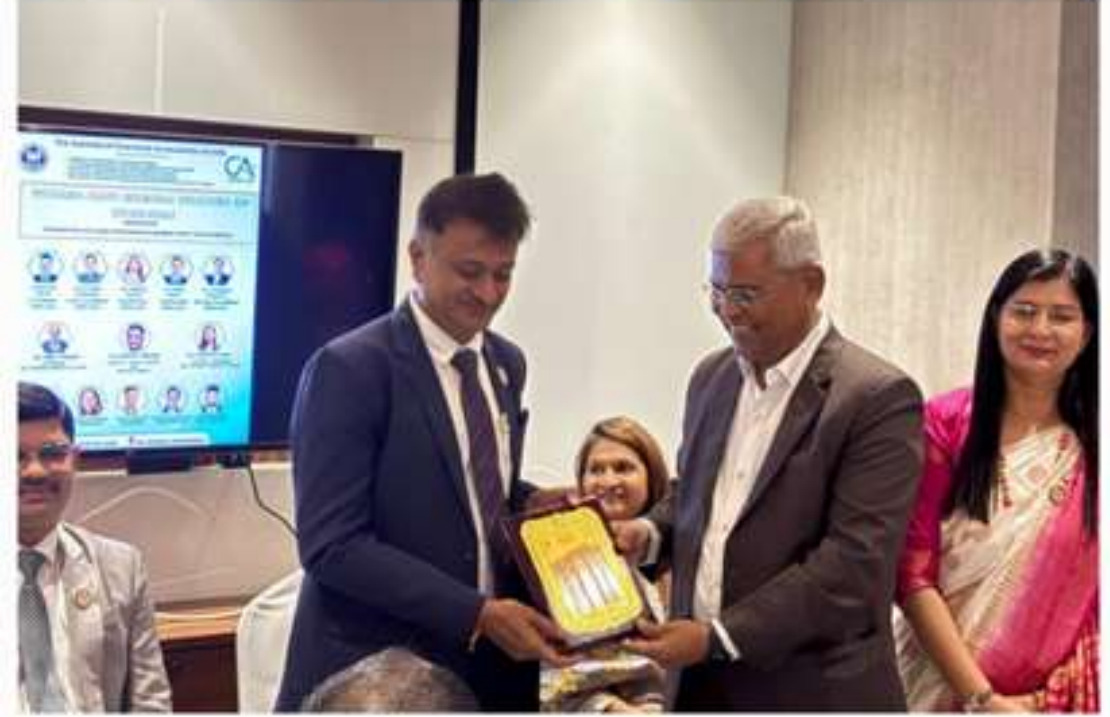
INTERACTION MEET OF OFFICE BEARER OF WIRC AND SENIOR MEMBERS WITH THE STUDENTS ON 25TH APRIL