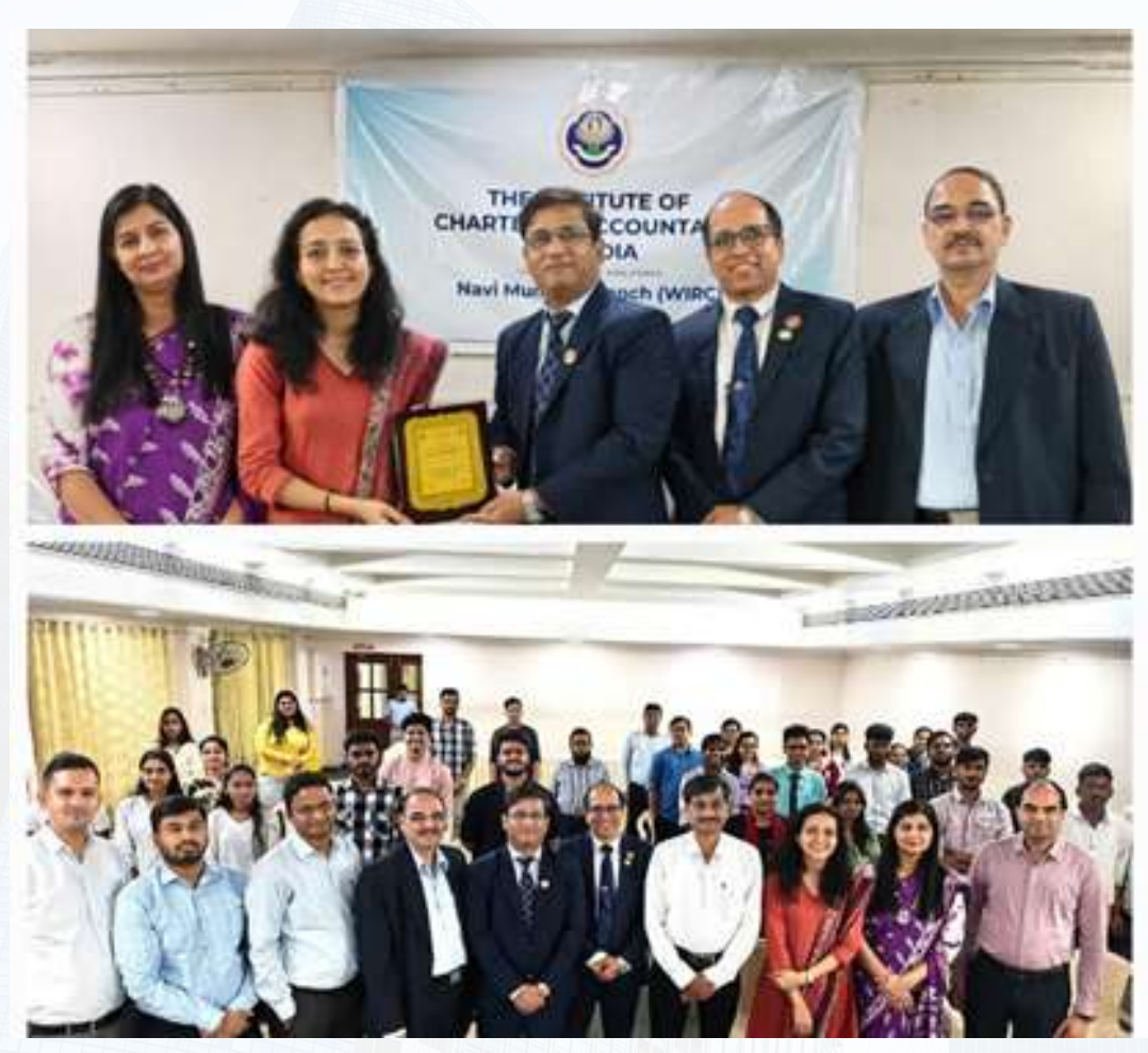
PRACTICAL TRAINING ON TDS RETURN FILLING 12/04/2025