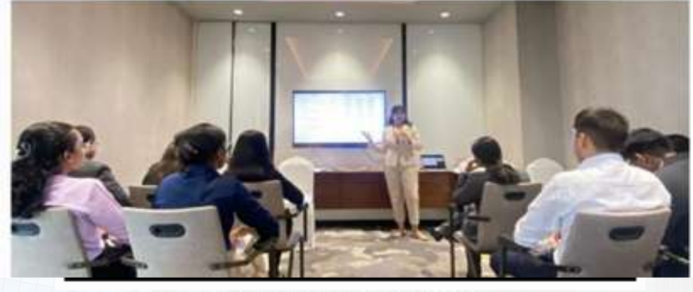
GUIDANCE NOTE ON ACCOUNTING FOR REAL ESTATE TRANSACTION ON 25TH APRIL