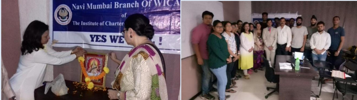
Inauguration of Crash Course

From 15 th March, 2018 Crash Course for CA students was organised for CA students appearing in CA examination.